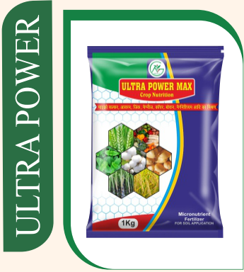
ULTRA POWER MAX MICRO+SULPHUR ELEMENTS 1, 4 & 5 KG PACKING