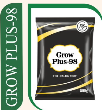
GROW PLUS-98 HUMIC ACID 500 GM PACKING