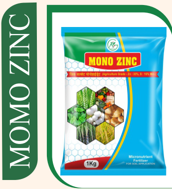
MONO ZINC MONO ZINC 33% 1 & 5 KG PACKING