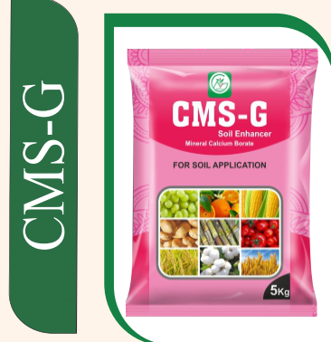
CMS-G CALCIUM MAGNESIUM SULPHUR BORAN 5 KG PACKING