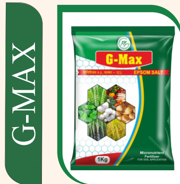
G-MAX MAGNESIUM SULPHET 1 & 5 KG PACKING