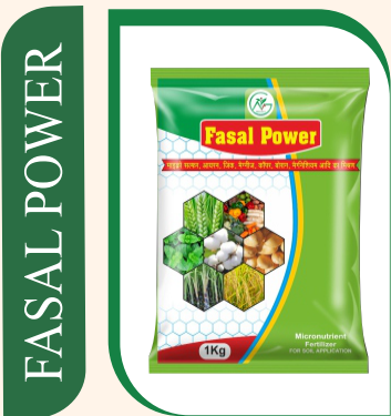
FASAL POWER MICRONUTRIENTS 6% 1 & 5 KG PACKING