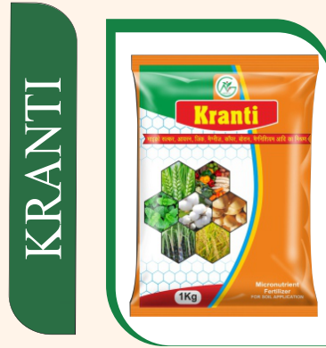
KRANTI MICRONUTRIENTS 10% 1 & 5 KG PACKING