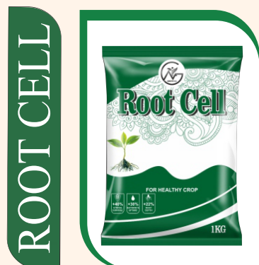
ROOT CELL MYCORRHIZAL BIO FERTILIZER 1, 4 KG PACKING